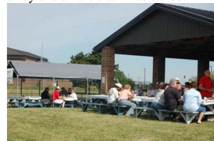
Umm Umm Good!

price was too low??) The MAC Club grossed $1,770. in proceeds. When all the bills are in it looks like we may clear approximately $500+. Everyone really pitched in and the clean up was fast. By 3PM everything was put away and all the trash was stored.