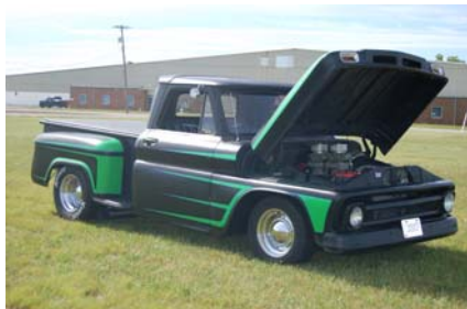
196?? Chev PU