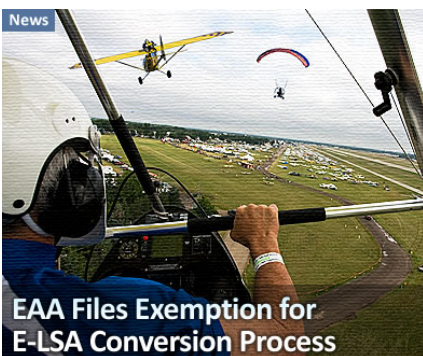
EAA Files Exemption for E-LSA Conversion Process